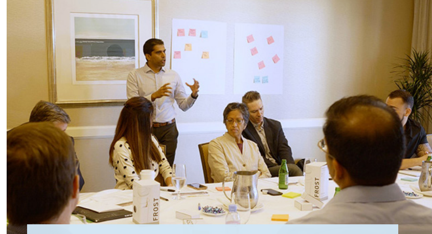
RP's Clinical Value Team works to identify best-inclass clinical programs and replicate those across the country—essentially elevating the level of care for every patient who receives care through RP providers.